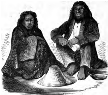
SYMGUIMATS AND WIFE, CHAMOIS INDIANS.

It was, indeed, a lovely spot. After watching the movements of the pretty little humming birds, I would go to the Indian village, which was only a short distance. The natives all appeared to dwell in harmony: I never heard squaw and husband disagreeing, and the following observations on marriage by an aged Indian, who for many years had spent much of his time among white people, and had